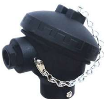
Big Enclosure Bakelite