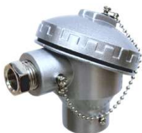
Big Enclosure Aluminum