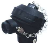
Small Enclosure Bakelite