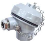
Small Enclosure Aluminum