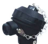
Small Enclosure Bakelite