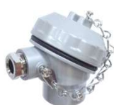
Small Enclosure Aluminum