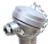
Small Enclosure Stainless Steel 316L