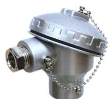
Big Enclosure Aluminum