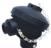
Big Enclosure Bakelite