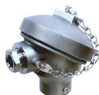
Big Enclosure Stainless Steel 316L